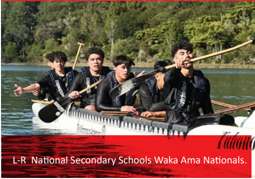
L-R National Secondary Schools Waka Ama Nationals.