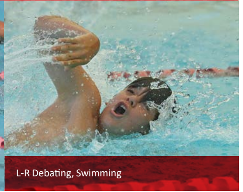
L-R Debating, Swimming