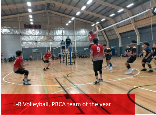
L-R Volleyball, PBCA team of the year